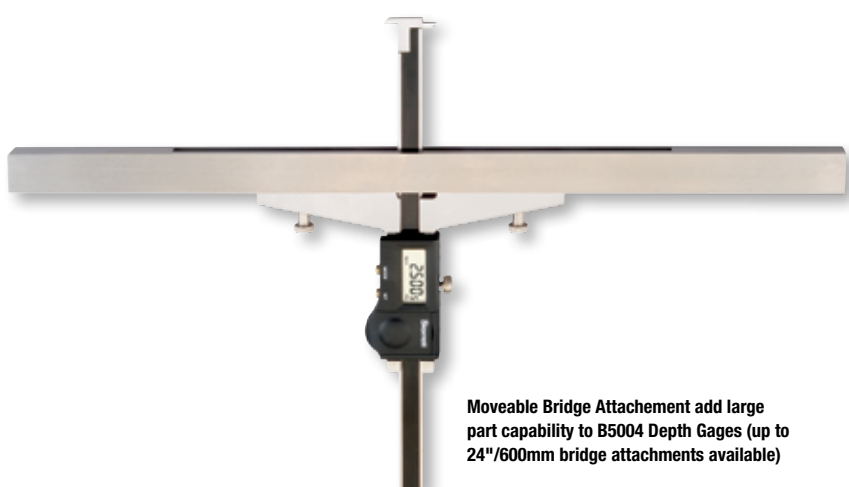
Moveable Bridge Attachment add large part capability to B5004 Depth Gages (up to 24"/600mm bridge attachments available)