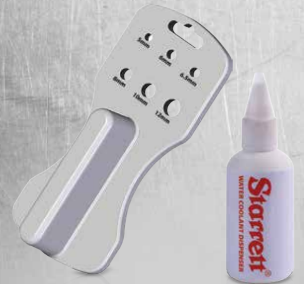
Diamond Tile Drill Guide

Diamond tile drill bit kit features 6 hole saws, 1 knock out pin and convenient carrying case.