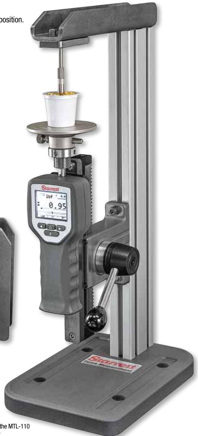
DFG Gage on the MTL-110 Manual Tester