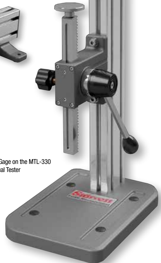
DFG Gage on the MTL-330 Manual Tester